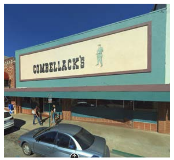
Figure 2. Street View: 339 Main Street